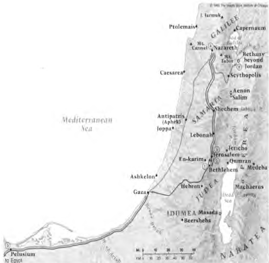
Jesus' Early Travels